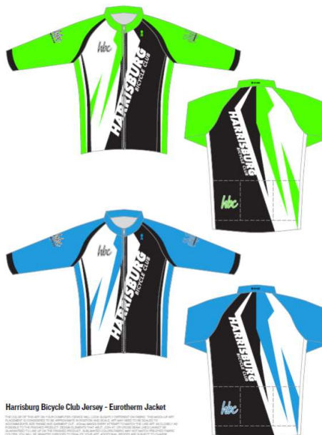
Harrisburg Bicycle Club Jersey - Eurotherm Jacket