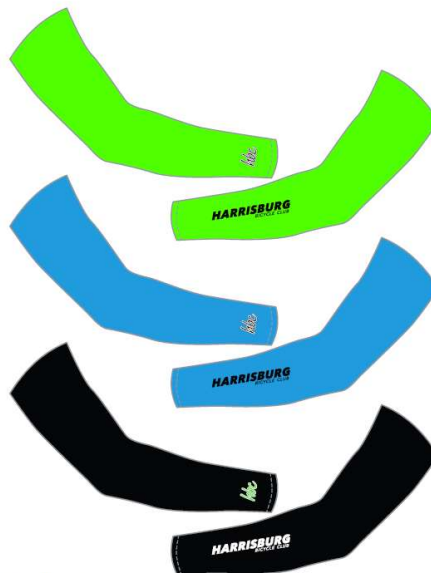
HBC Arm Warmers

Order online at https://vomax.com/collections/Harrisburg-Bicycle-Club